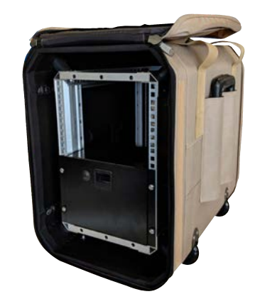
Edge Wheels and retractable handles