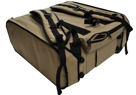
Camera rain cover and shoulder straps cpcases.com/products/19-racks/satrack