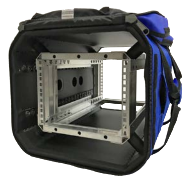
CV2 chassis showing construction and joints and anti-vibration suspension mounts