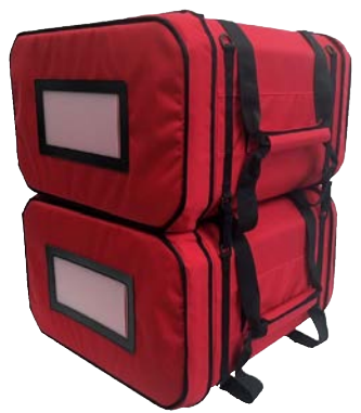
Interlocking feet and straps to secure stacking and a labelling option.

e2v Stella 180 Watt Amp in custom chassis